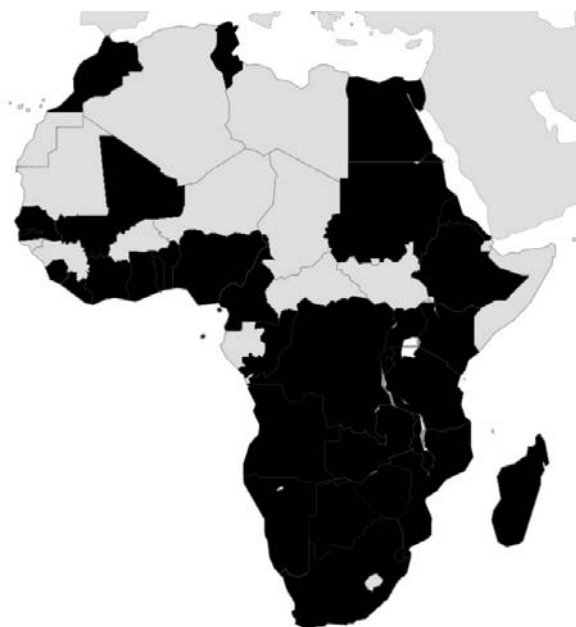
China’s Confucius Institutes in Africa

alleviation. In May 2007, at the annual conference of the African Development Bank Council held in Shanghai, questions like African infrastructure construction, enterprise capability construction, debt management and poverty alleviation were discussed. That is another significant action taken by China to promote exchange and cooperation with African countries in aspects of development experience and state affairs management. After the Beijing Summit of FOCAC Thabo Mbeki, former president of South Africa wrote an article titled “At the Heavenly Gate in Beijing hope is born” highly praising China’s “Great achievements in development” and its practical significance to Africa’s development 4 . The World Bank also acknowledged, “China’s efforts created immediate opportunities for the economy of other developing countries as well as chances for them to acquire abundant knowledge and experience from China in regard to their own development.”